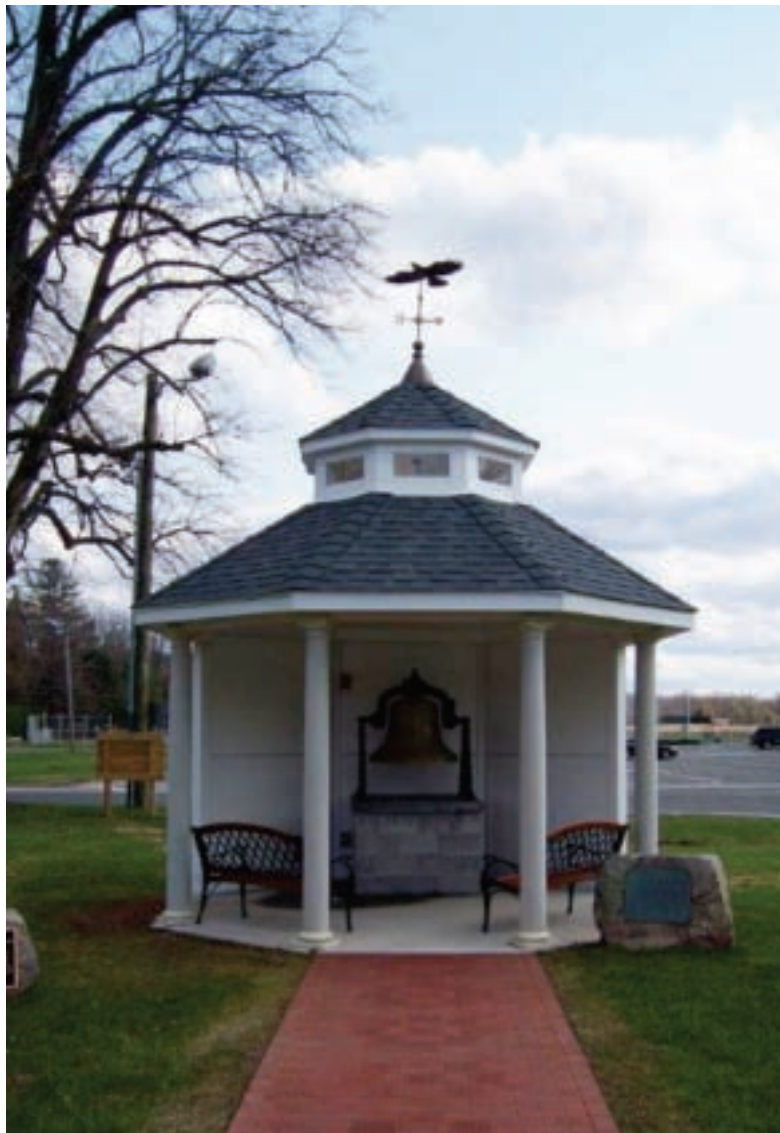
School Bell Memorial