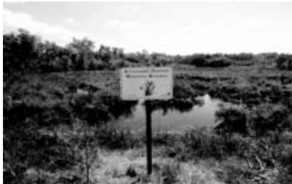
Dawson Wildlife Reserve

a draft soon for public review. A highlight of the year was the formal dedication of the Alexandra Dawson Wildlife Reserve in early June. Friends and family came together to celebrate the dedication of the wildlife habitat that meant so much to her.