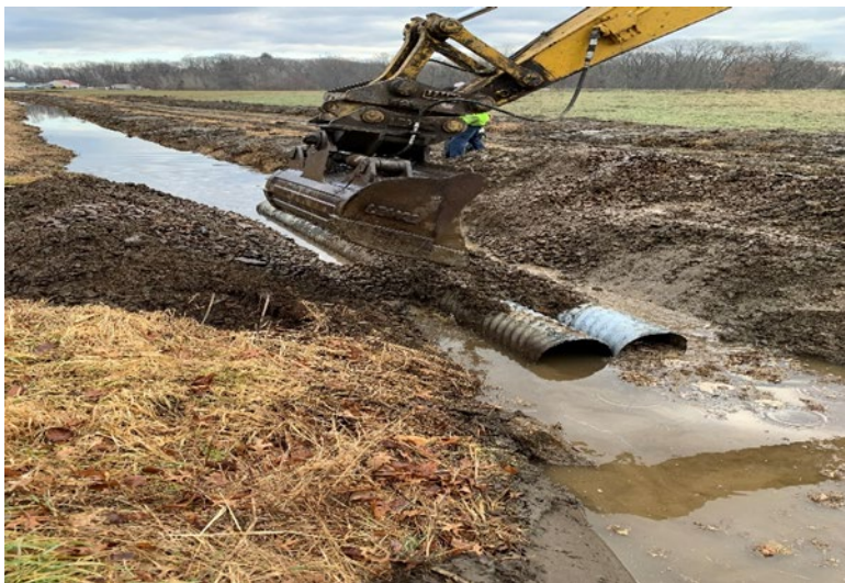
Example of the agricultural and drainage ditch maintenance.