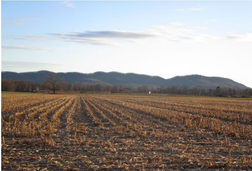
Mount Holyoke Range view from Hadley Dec2020