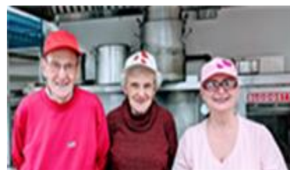
Nora's Lunch Box Homemade Meals