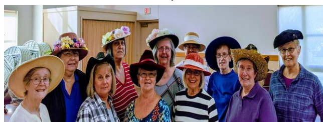
Wear a Crazy Hat Day – Line Dancing Class