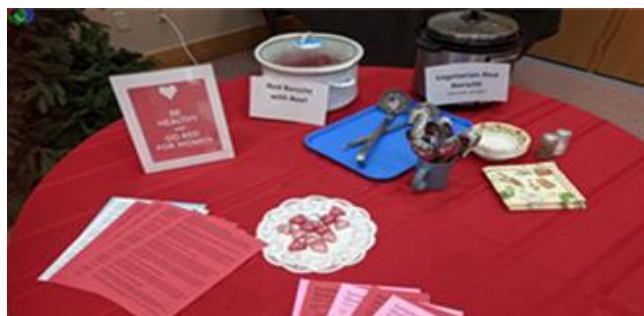
Go Red for Women's Health Day - Red Borscht Sample