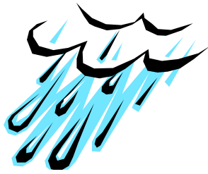
Storm Water Runoff Is Untreated !

Stormwater runoff is rain or snowmelt that flows over the ground. As it flows over driveways, streets, lawns and sidewalks, it picks up debris, chemicals, dirt, and other pollutants. Storm water flows into drainage ditches or catch basins which are part of Hadley's storm water system. Stormwater runoff is discharged untreated directly into lakes, streams, rivers and wetlands.